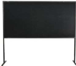
Horizontal Display Board