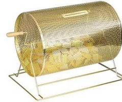
Small Metal Draw Barrel