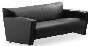
Tribeca Black 3 Seat Sofa